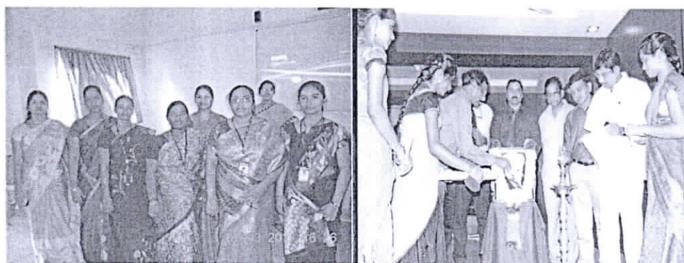
Teachers standing with joy and happiness