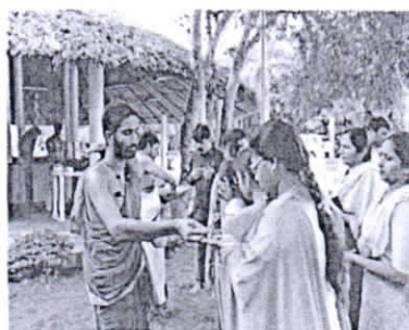
To mark the Sanctity and holiness prasadam is being distributed on account of Durga pooja