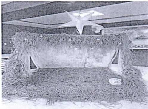
Crib all set for the celebration