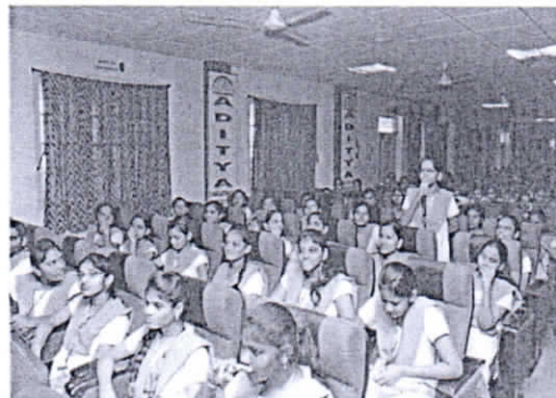
Students attended the session and marked great flavor.